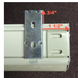
Top View of Head Rail with bracket